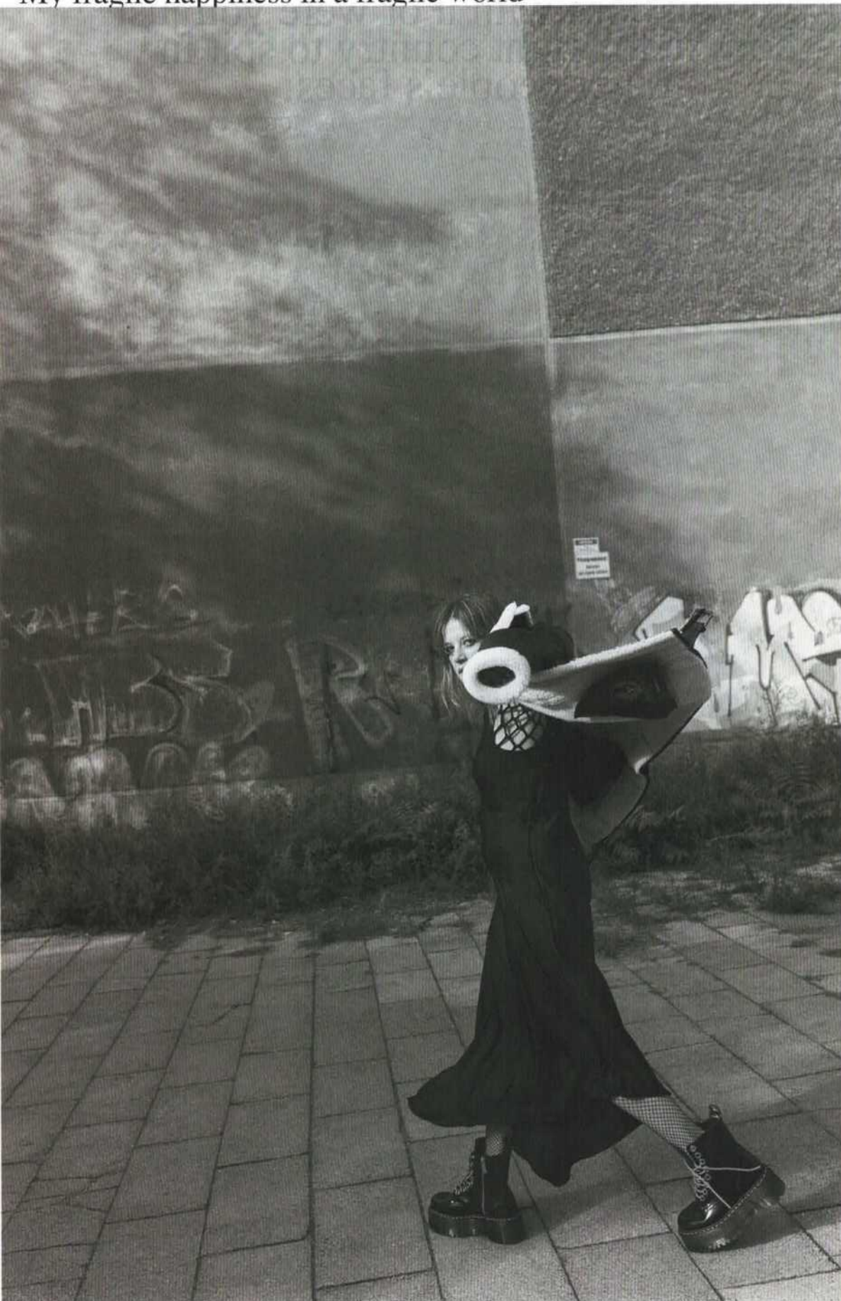
62 Jacket BELSTAFF Dress CALVIN KLEIN Boots DR. MARTENS Tights WOLFORD

Without morals and without dignity, you approve consumption as if there were no tomorrow My fragile happiness in a fragile world –